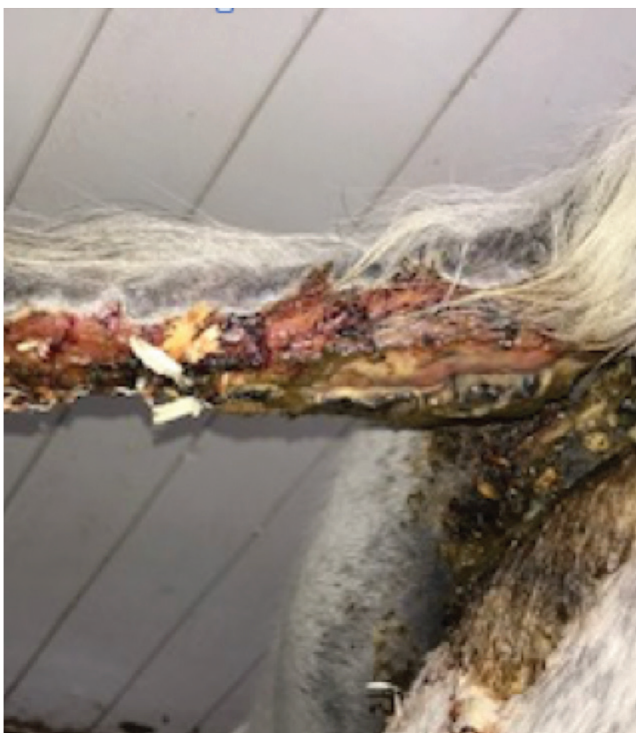
2/21/20 Tail fully necrosed and infected