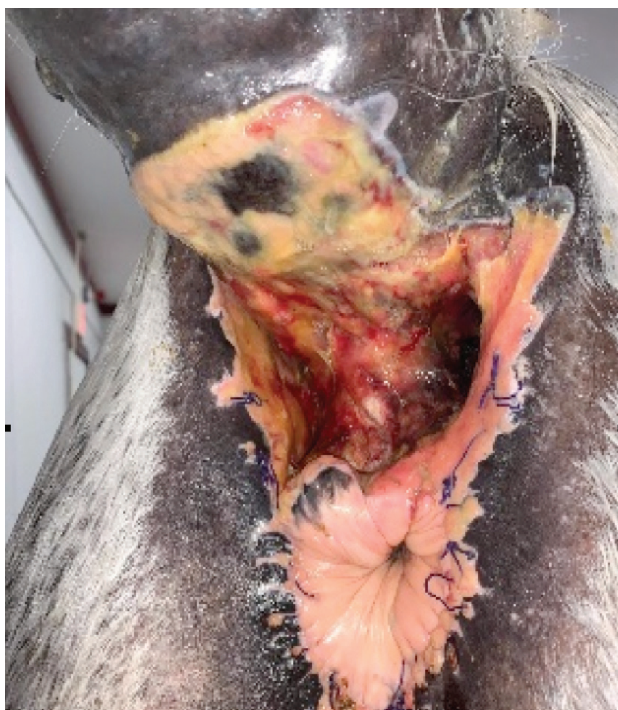
1/14/20 Excision of melanoma