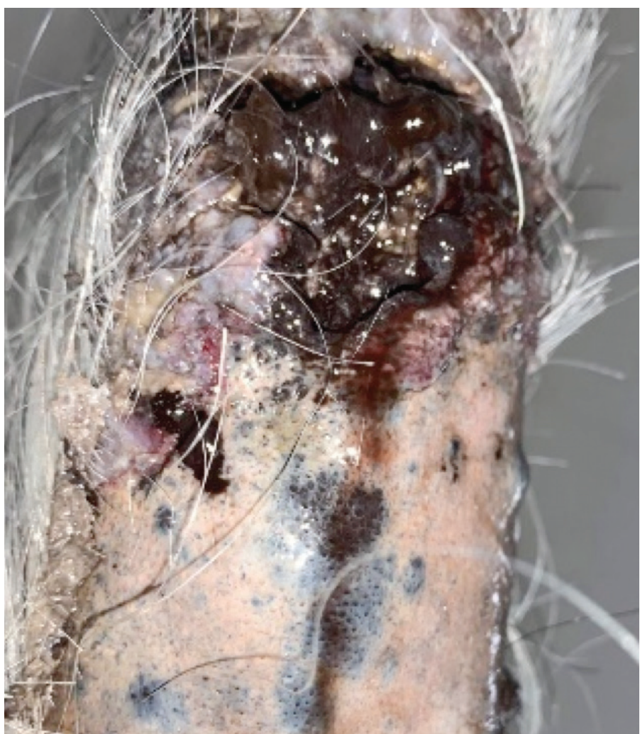
1/16/20 Necrosis at mid-tail